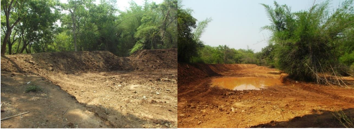
Deepening & Desilting Percolation pond (Semman kuttai) – TN Palayam Range