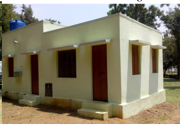
Improvement of Trekking shed at Talamalai in Talamalai Range