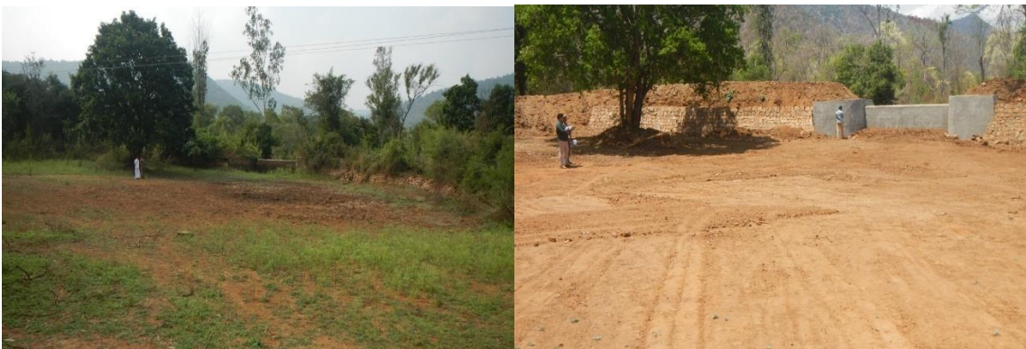
Improvement of Percolation pondThailamara Kuttai in Makkampalayam beat TN Palayam Range