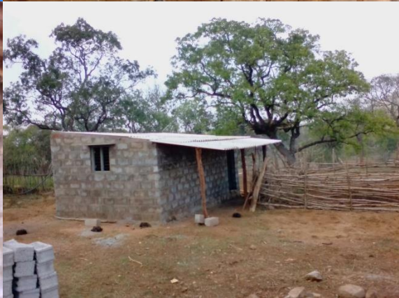
Repair and Improvement of Tribal Houses in Talamalai Range