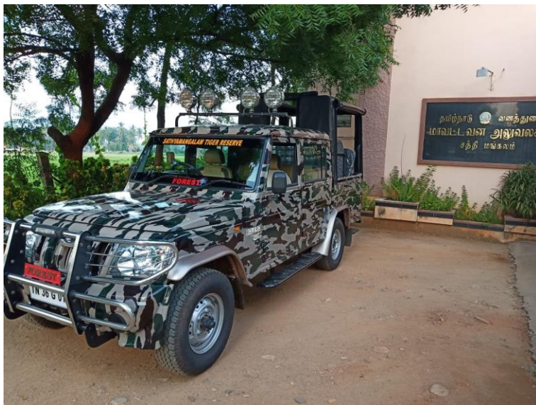
Purchase of Anti-depredation vehicle for Kadambur for addressing conflict emergencies