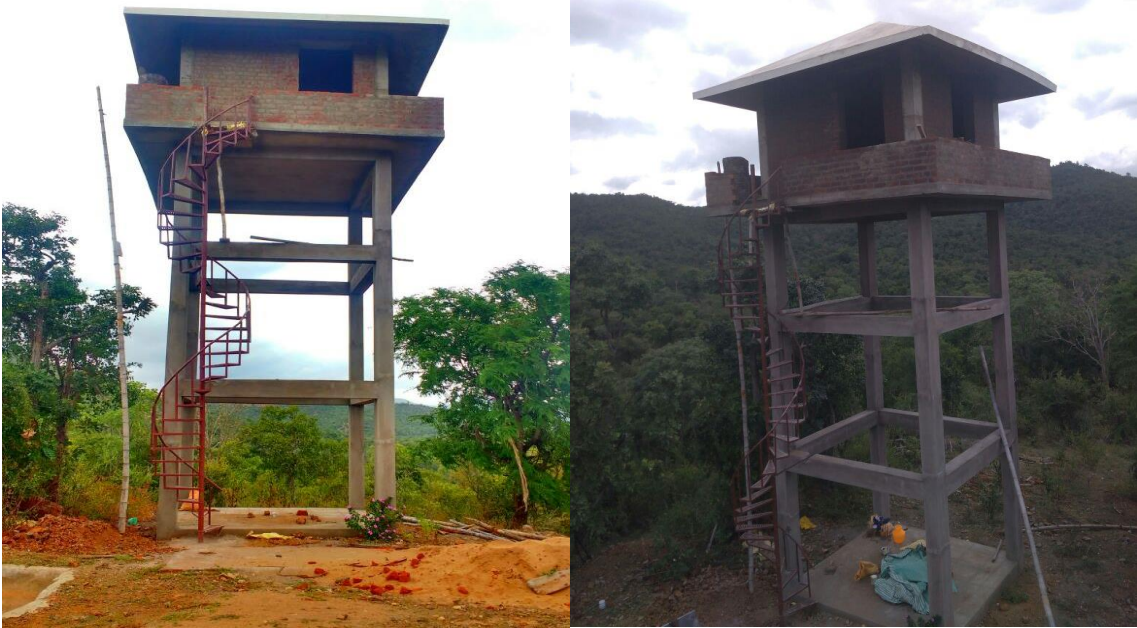
Construction and Improvement of Fire watch tower- TN Palayam Range