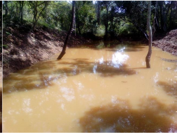
Construction of Orathi kuttai Check dam at Anaikarai beat of Ekkathur Section in Sathyamangalam Range