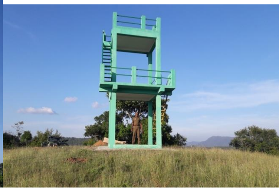
Construction of Fire watch tower at Raman gudda at Talamalai beat in Talamalai Range