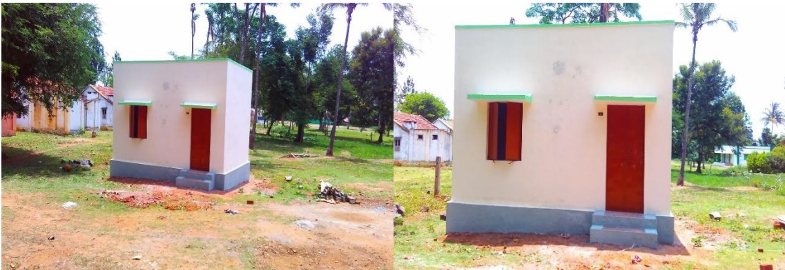
Construction of Trekking shed