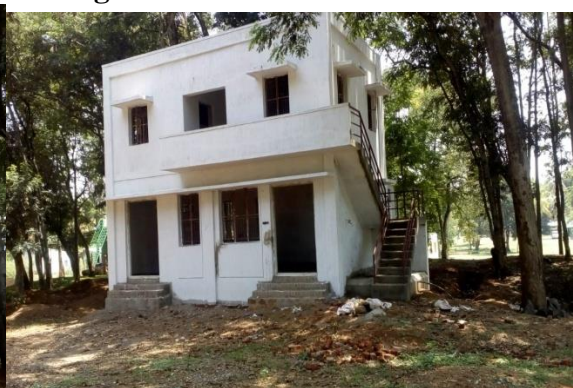
Construction of Livelihood centre at Talamalai in Talamalai Range