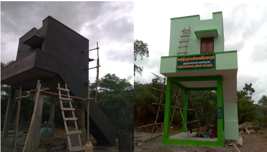
Construction of Fire Watch Tower -Imbikombaisaragam in Makkampalayam TN Palayam Range