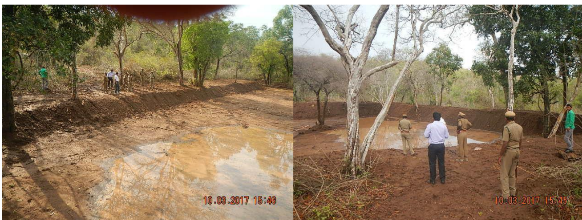
Desilting the existing Alamarakodikal kuttai in Ekkathur Section Sathyamangalam Range