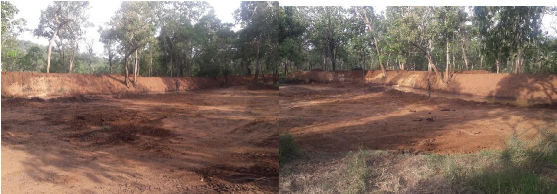
Maintenance of Percolation pond by deepening and desilting at Varagara kuttai in Talamalai Range