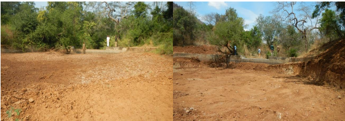
Improvement of Percolation PondLakkepallam in Makkampalayam TN Palayam Range