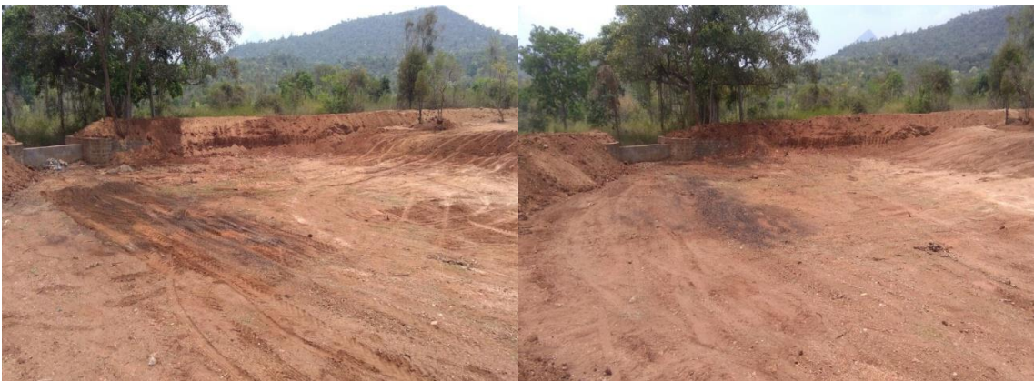
Maintenance of Alamarathu Kodikal Percolation pond at Anaikkarai beat in Sathyamangalam Range