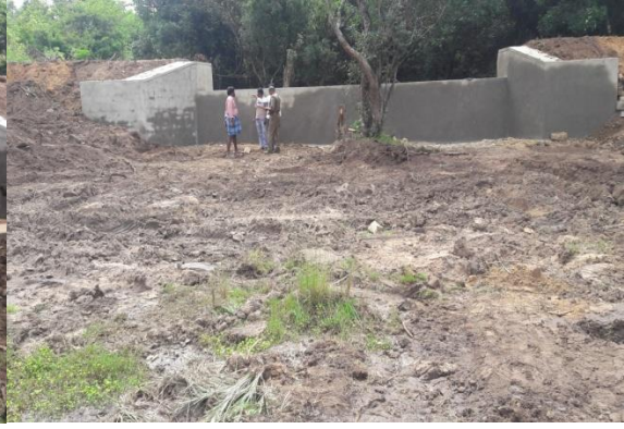
Construction of Percolation Pond at Ittarai in Talamalai Range