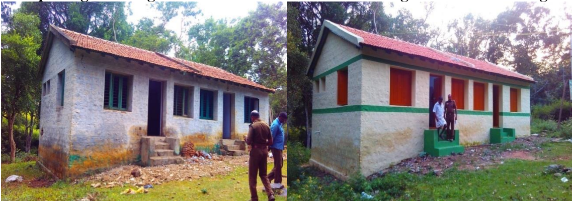
Improvement and maintenance of Forest Guard Quarters at Bejalatti in Talamalai Range