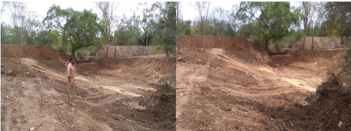
Maintenance of Padarkarai Kodikal Check dam at Ekkathur beat in Sathyamangalam Range during 2017-18.