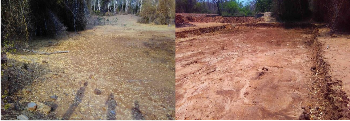
Deepening and Desilting of Percolation Pond - Onagala kuttai – Talamalai Range