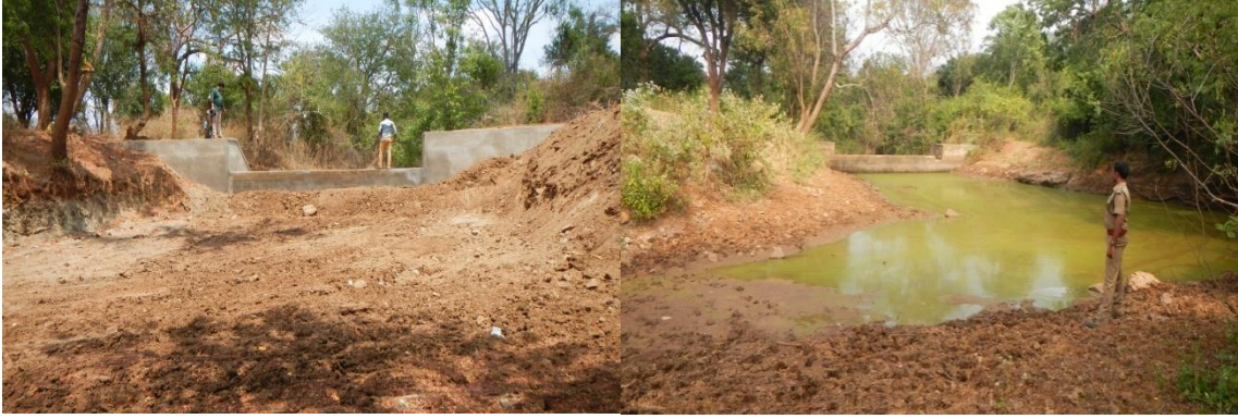
Improvement of Checkdam - Lakkepallam in Makkampalayam beat TN Palayam Range