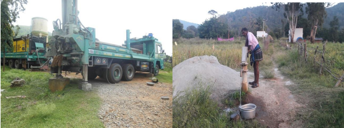
Repairing Drinking water Bore well at Ramaranai village in Talamalai Range