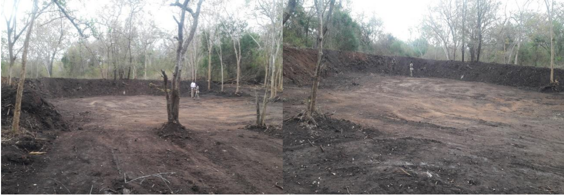
Maintenance of PP by deepening and desilting at Aralikuttai in Talamalai Range