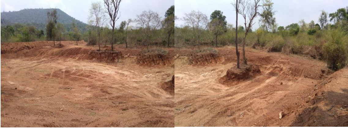
Maintenance of Padarkarai Kodikal Percolation pond at Ekkathur beat in Sathyamangalam Range