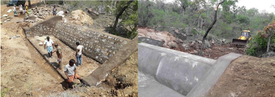
Construction of Check Dam in Jalamara pallam - Talamalai Range