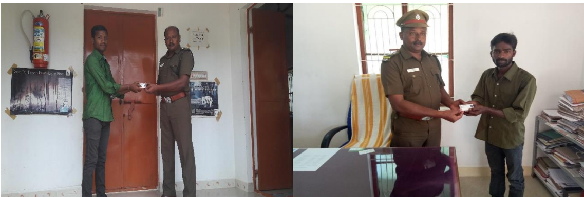
Providing Training and Issuing free Driving License – Talamalai Range