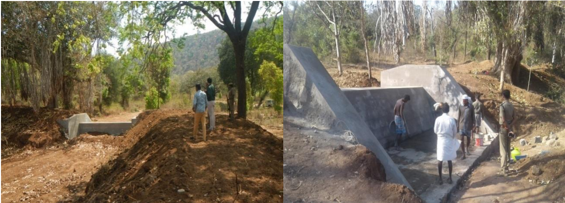
Construction of Percolation Pond - AlamarathuKodikkal in Arigiyam beat TN Palayam Range