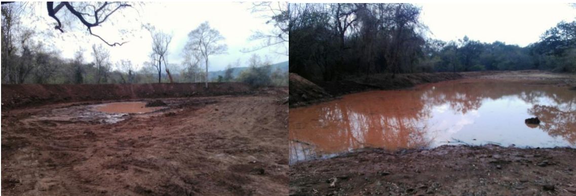
Deepening & Desilting Percolation pond (Soori kuttai) – TN Palayam Range